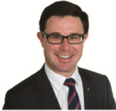
The Hon. David Littleproud MP Minister for Agriculture and Water Resources