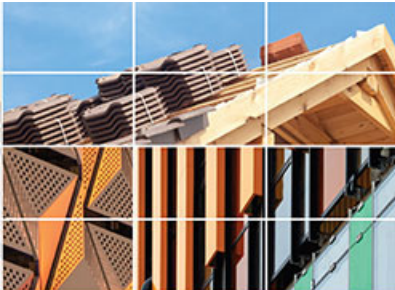
Building Products Performance Good Practice Regulatory Framework